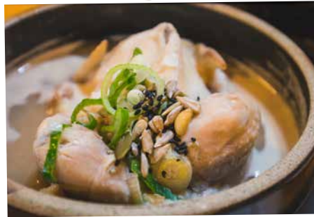
人参鸡汤 / Ginseng Chicken Soup