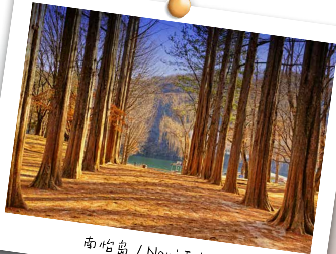
南怡岛 / Nami Island