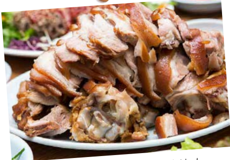
韩方猪蹄定食 / Hanbang Jokbal