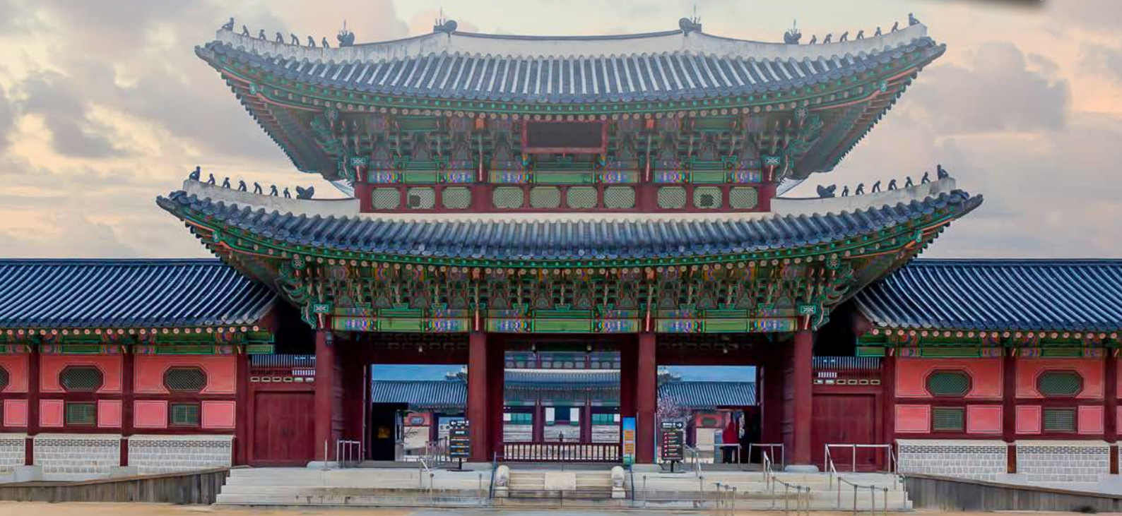
景福宫 Gyeongbokgung Palace