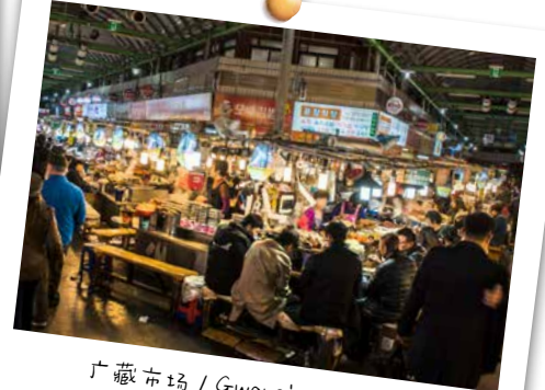
广藏市场 / Gwangjang Market