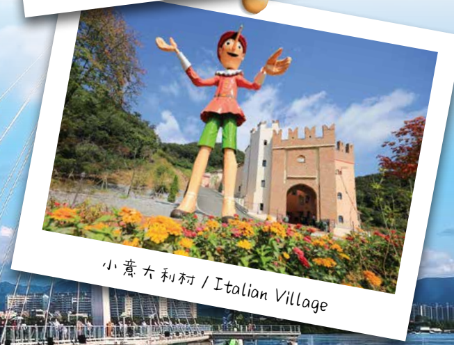
小意大利村 / Italian Village