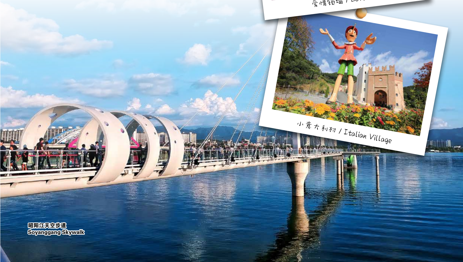
昭阳江天空步道 Soyanggang Skywalk