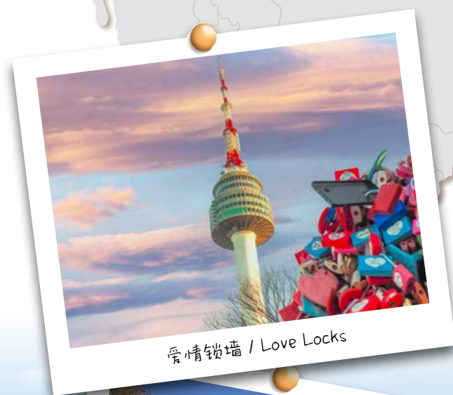
爱情锁墙 / Love Locks