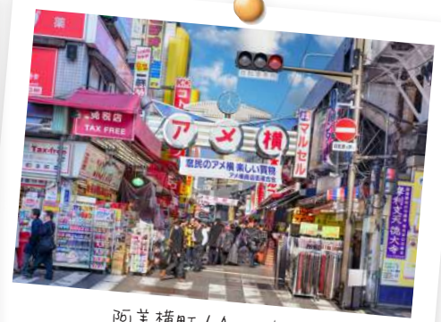
阿美横町 / Ameyoko