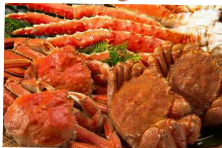
三大北海道螃蟹任吃 3 Kind Hokkaido Crab & Buffet