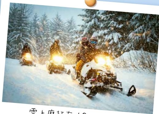
雪上摩托车 / Snow Mobile