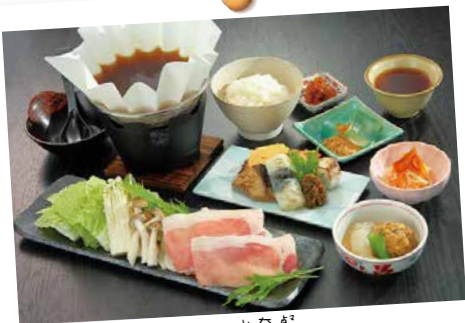
日式套餐 Japanese Set