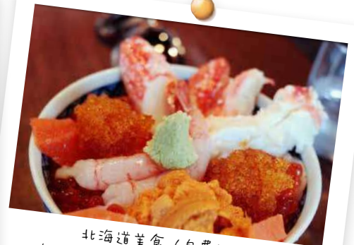
北海道美食 (自费) Hokkaido Gourmet (Own expense)