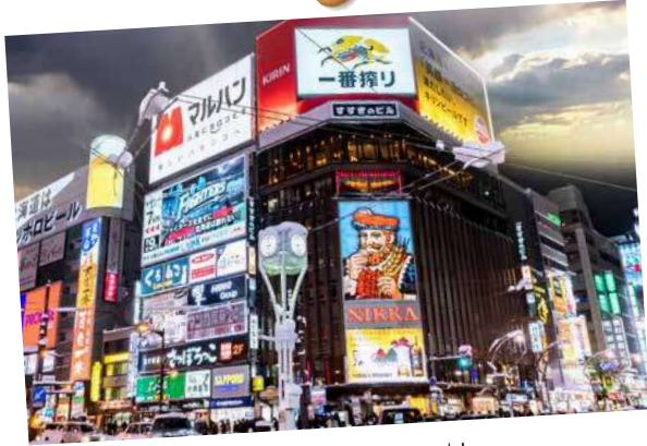
札幌すすき野城 / Susukino

※ Sequence of the itinerary is subject to change according to the final flight confirmation.