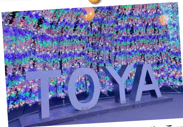
洞爷湖照明隧道 / Lake Toya Illumination Tunnel