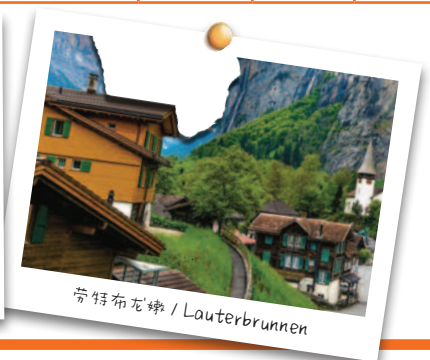
劳特布龙嫩 / Lauterbrunnen