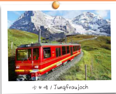
少女峰 / Jungfrauoch