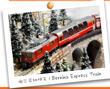
伯尔尼纳快车 / Bernina Express Train