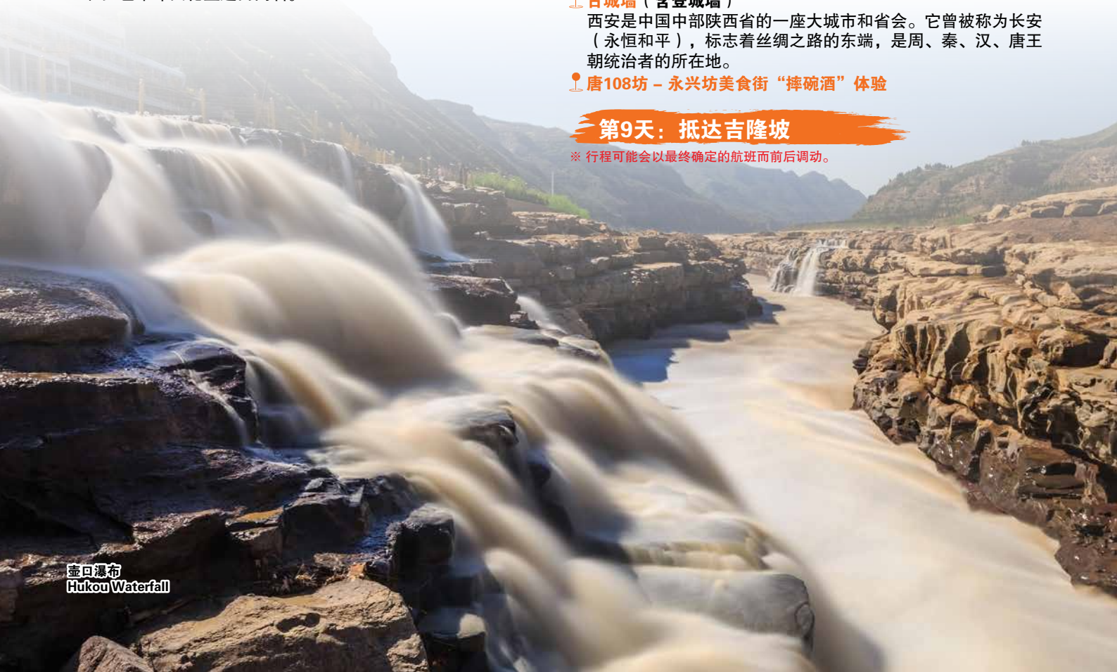
壶口瀑布 Hukou Waterfall