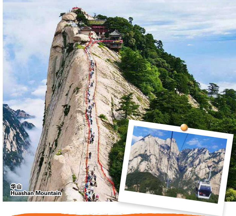
华山 Huashan Mountain

它是延安的主要景点之一, 这条街道以其独特的历史文化氛围和红色革命文化主题而闻名。