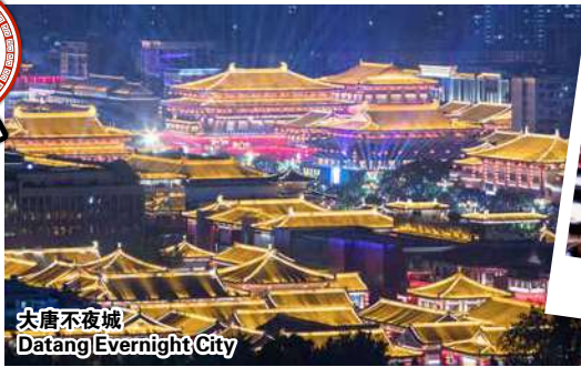
大唐不夜城 Datang Evernight City