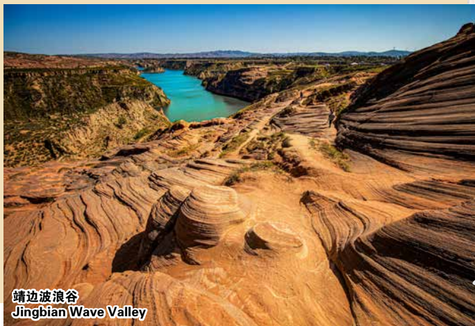
靖边波浪谷 Jingbian Wave Valley

⚠️ Sequence of the itinerary is subject to change according to the final flight confirmation.