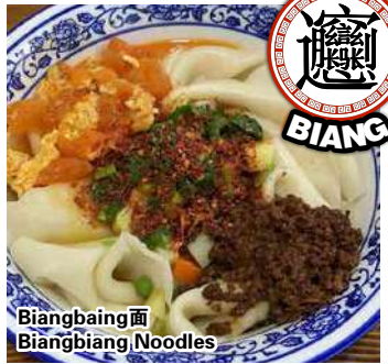
Biangbiang面 Biangbiang Noodles