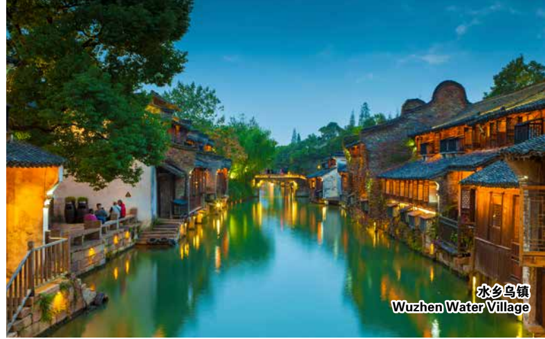
水乡乌镇 Wuzhen Water Village

大佛位于江苏省无锡市太湖北岸。它是中国乃至世界上最大的佛像之一。灵山梵宫建筑采用汉藏风格，融合了摩崖石窟和传统佛教建筑元素。