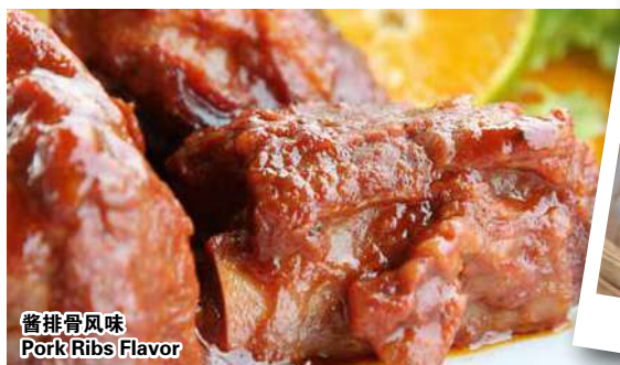
酱排骨风味 Pork Ribs Flavor