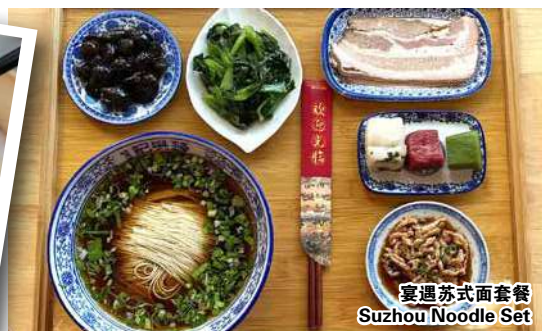
宴遇苏式面套餐 Suzhou Noodle Set