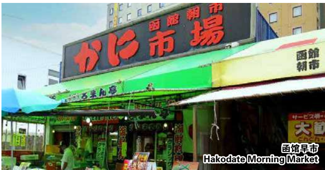
函館早市 Hakodate Morning Market

On the square of Toyoko Hot Spring Street, there is a 70-meter-long coloured light tunnel built with about 400,000 neon bulbs.