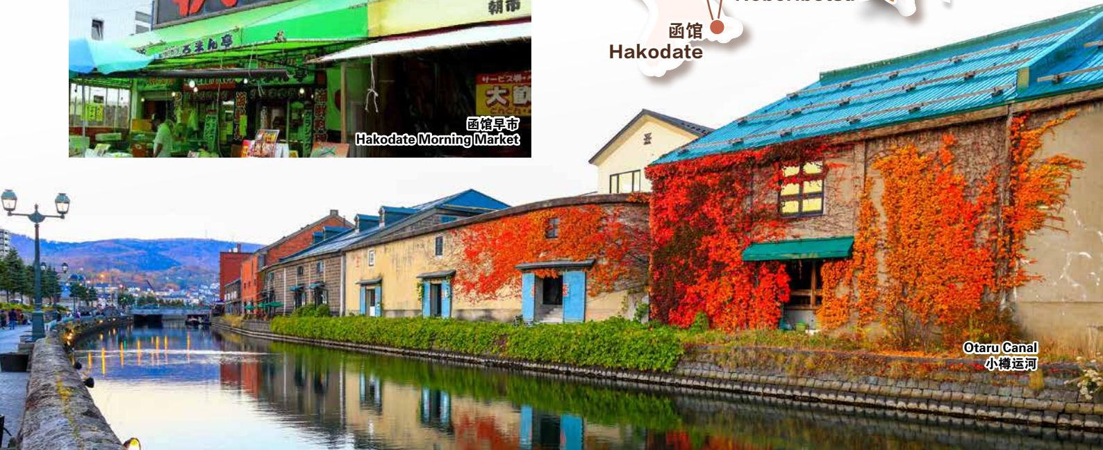
Otaru Canal 小樽运河