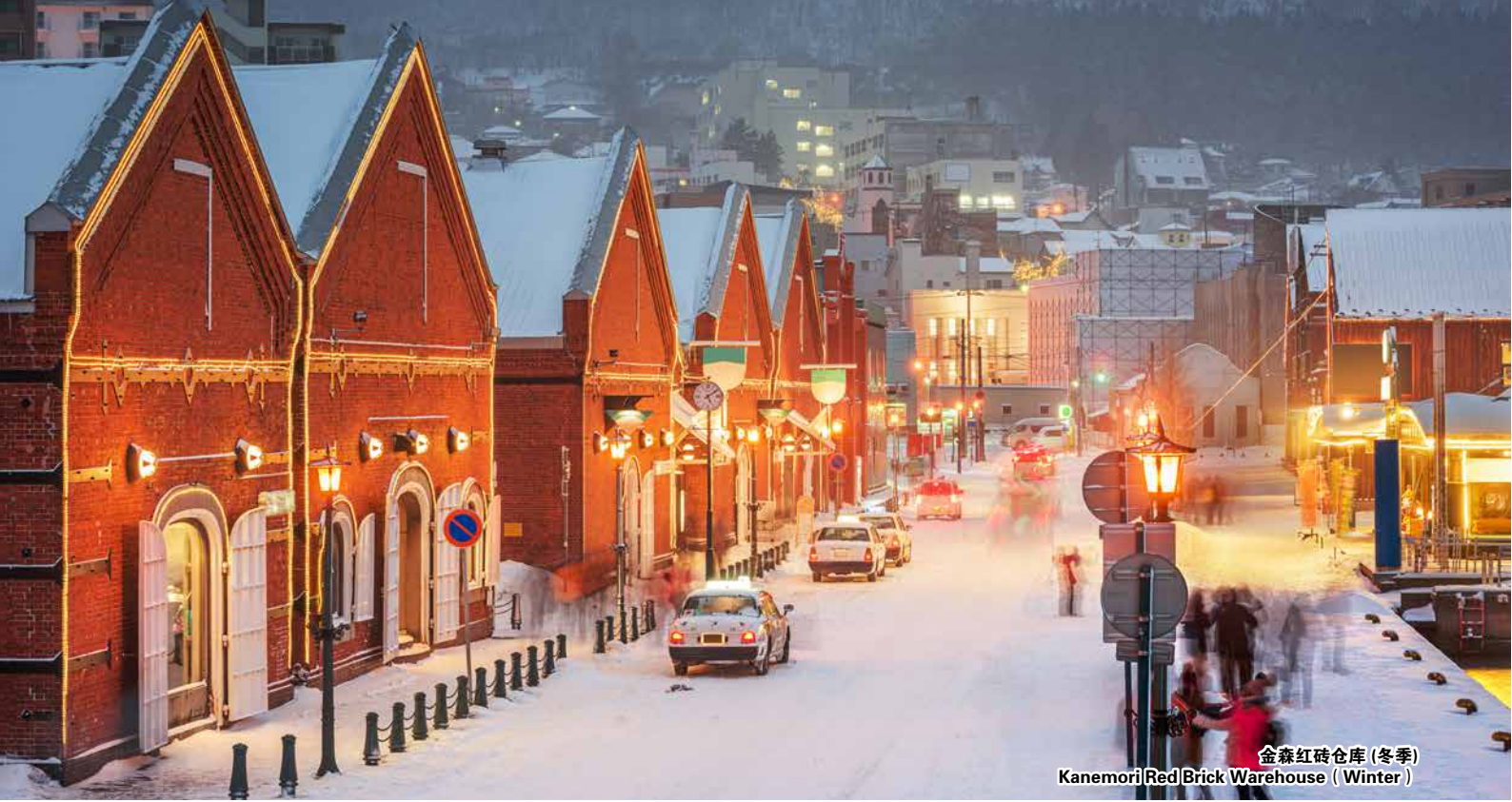
金森红砖仓库(冬季) Kanemori Red Brick Warehouse ( Winter )